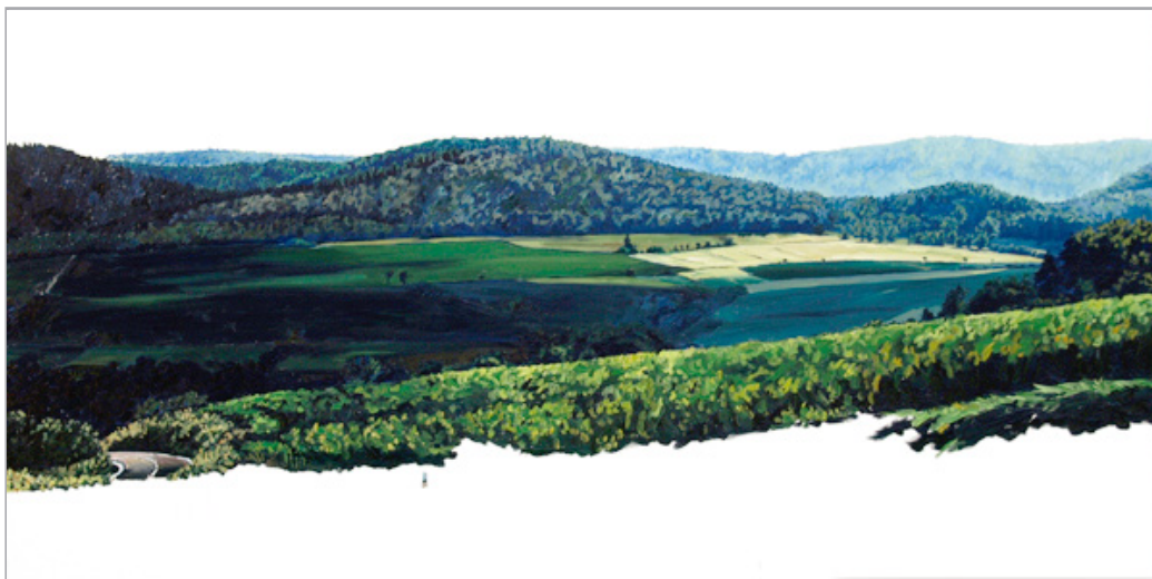
Dark Green, 2009, oil on canvas

Reception: Saturday, 26th September 6-8pm